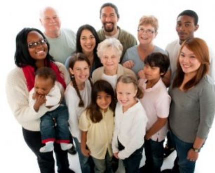
Blended Family or Domestic Partners