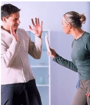
May Get a Divorce