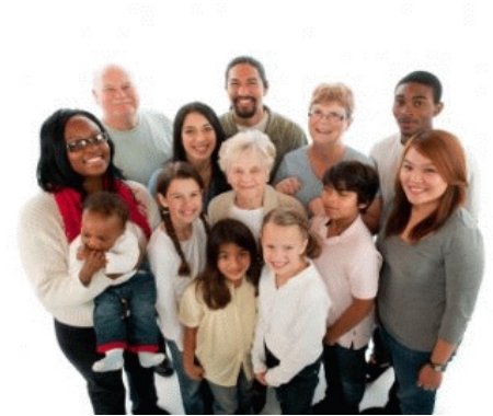
Blended Families or Domestic Partners