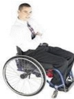
Special Needs Person