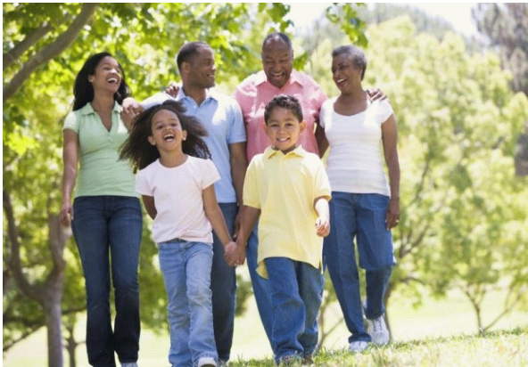
Couple with Children