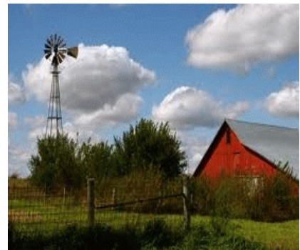
Family Farm or Business